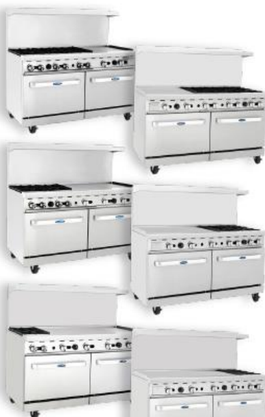
AGR-6B24G AGR-4B36G AGR-2B48G