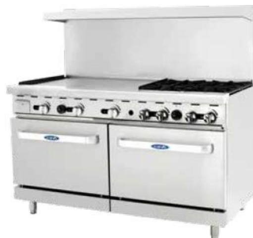
Gas Range Griddle Combinations (ATO-4B36G)