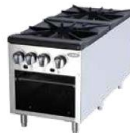
Stock Pot Stoves (ATSP-18-2L)