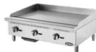
Manual Griddles (ATMG-36 HD 36)