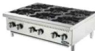
Hot Plate (ATHP-36)