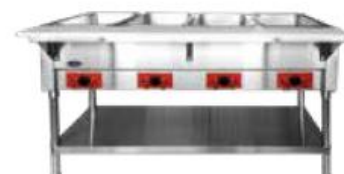
Steam Tables (CSTE-4 / CTEB-4)

Other models from each series are available. Please see Autoquotes or our website for a the full spectrum of products: www.atosausa.com