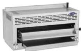
Salamander Broilers (ATSB-36)