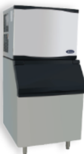
YR450-AP-161 / YR800-AP-261