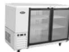
Back Bar Coolers (MBB59-G)

Other models from each series are available. Please see Autoquotes or our website for a the full spectrum of products: www.atosausa.com