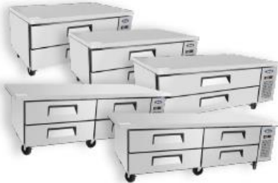
MGF8450GR MGF8451GR MGF8452GR MGF8453GR MGF8454GR