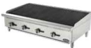
Char-Rock Broilers (ATCB-48)