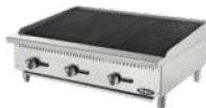
Radiant Broilers (ATRC-36)