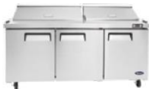
Sandwich Preps (MSF8304)