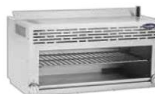
Cheese Melters (ATCM-36)