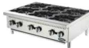
Hot Plate (ATHP-36)