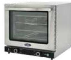
Convection Ovens (CRCC50-S)