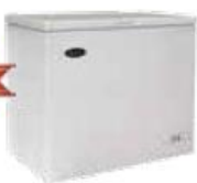
Solid Top Chest Freezers (MWF-9016)