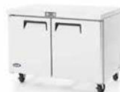
Undercounter Refrigerators (MGF8402)