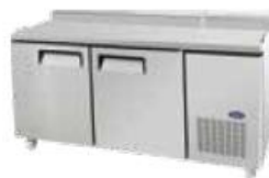
Pizza Prep (MPF8202)