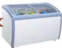
Glass Arc Lid Chest Freezer (MWF-9112)