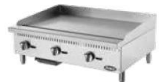
Manual Griddles (ATMG-36 HD 36)