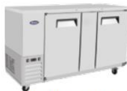
Back Bar Cooler (MBB69)