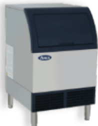
YR140-AP-161 / YR280-AP-161