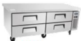
Chef Base (MGF8453)