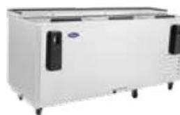
Bar Coolers (MBC80)