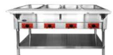
Steam Tables (CSTE-4 / CTEB-4)