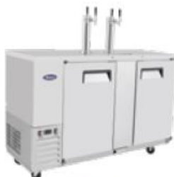
Keg Coolers (MKC58)