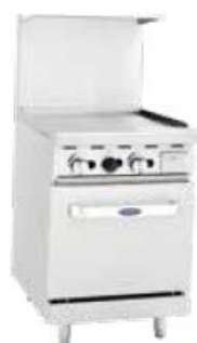
Gas Range Griddles (ATO-24G)