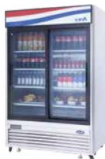
Bottom Mount 2 Door Lighted Sliding Glass Refrigerator (MCF8709)