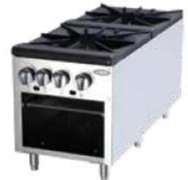
Stock Pot Stoves (ATSP-18-2L)