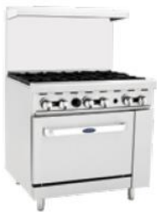
Gas Ranges (ATO-6B)