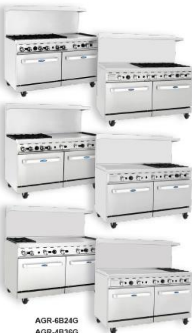
AGR-6B24G AGR-4B36G AGR-2B48G