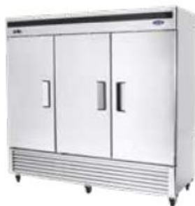
Bottom Mount Refrigerators (MBF8508)