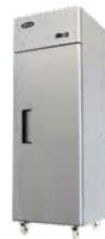
Top Mount Reach-ins (MBF8001)