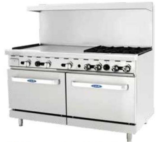
Gas Range Griddle Combinations (ATO-4B36G)